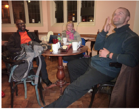
One of our prayer teams looking very spiritual!